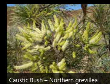
Caustic Bush - Northern grevillea